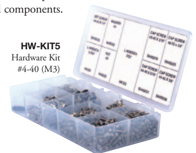
HW-KIT5 Hardware Kit #4-40 (M3)