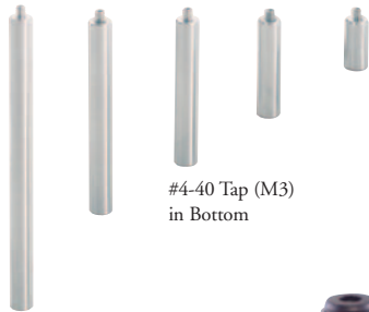
#4-40 Tap (M3) in Bottom