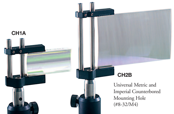
CH2B Universal Metric and Imperial Counterbored Mounting Hole (#8-32/M4)

*Universal Design, Imperial and Metric Compatible