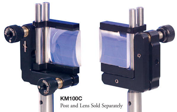
KM100C Post and Lens Sold Separately

*Universal Design, Imperial and Metric Compatible